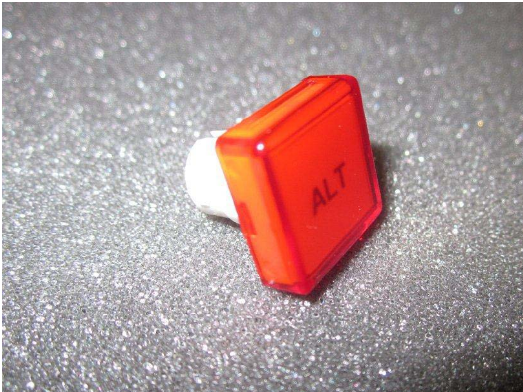
Figure 4 : Assembled diffuser, placard and lens cover.