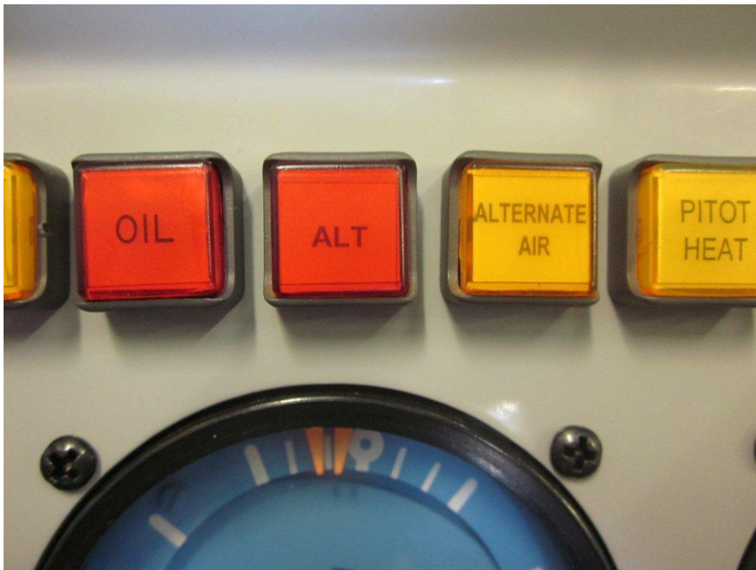
Figure 5 : Completed modification.