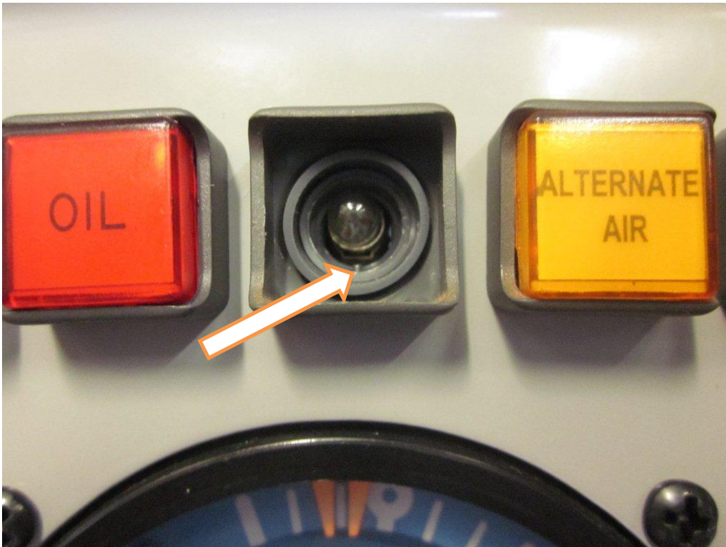
Figure 2 : Lenses removed from ALT indicator